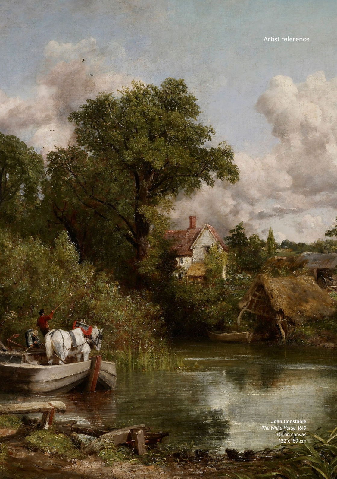
John Constable The White Horse , 1819 Oil on canvas 132 x 189 cm