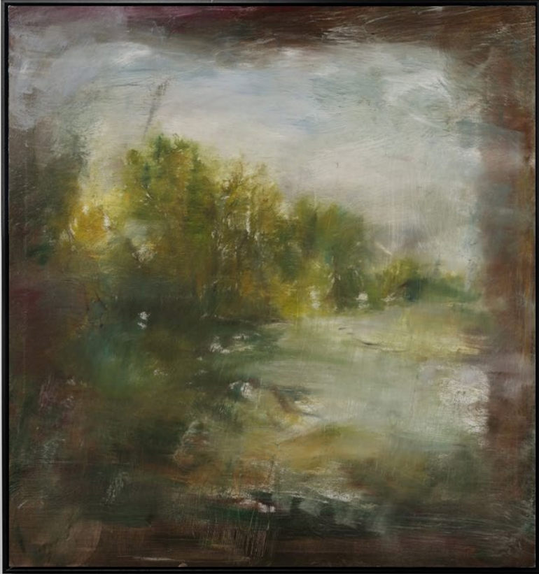
Stratford Mill, after Constable, 2023 Oil on canvas 165 x 155 cm