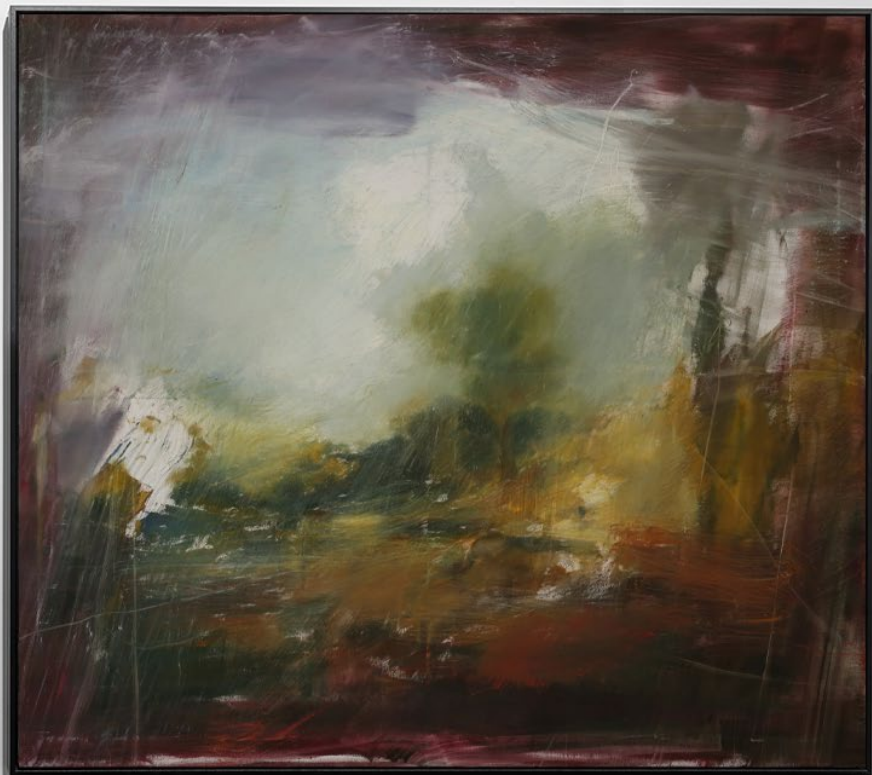
Landscape with Stream and Weir, after Thomas Gainsborough, 2023 Oil on canvas 155 x 175 cm