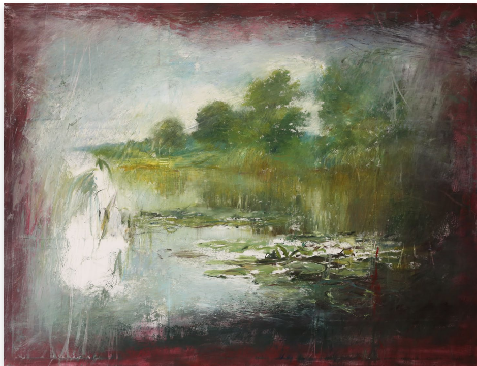
Water Lilies, after Benjamin Williams Leader, 2023 Oil on canvas 205 x 265 cm